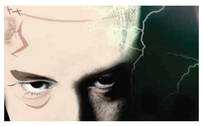
Mary Shelley's classic tale re-imagined in a spine-tingling new version – not for the faint-hearted.

Frankenstein is an astonishing adaptation and it was a huge hit for the National Theatre, London in 2011. The play gives the Creature a voice – this is a Creature that talks, that can be articulate about the way he feels – and the way he feels is very angry.