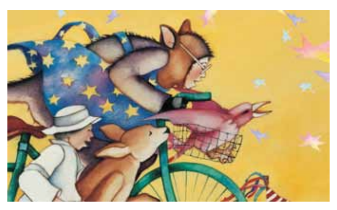
Based on the book written by Mem Fox and illustrated by Julie Vivas.

Grandma Poss made bush magic. She made Wombats blue and Kookaburra's pink, Dingo's smile and Emu's shrink, but the best magic of all was the Possum Magic that made Baby Hush invisible.